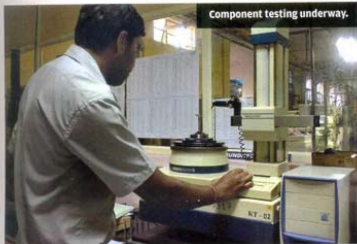
Component testing underway.